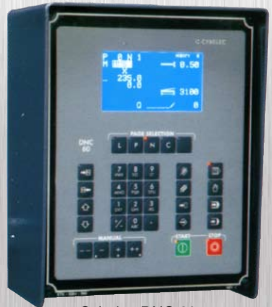
Cybelec DNC 60